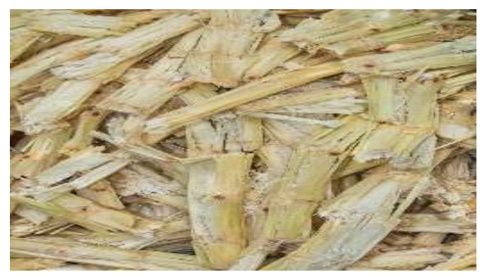
Figure 5: SB sample [20].

Bm from LnC, such as SB, is the remains from the extraction of juice from sugar. It is a readily available, low-cost and renewable resource that has a high potential for use in various applications, including bioplastics, Bf and other value-added products. SB (Fig. 5) is made out of Cl, HmCl and Ln [20].