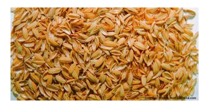
Figure 2: RH [17].

Different Bm are researched for power generation and environmental problems [16, 17]. Rice is an important source of carbohydrates. RH is also considered to be AW. Cultivation of crops materials like RH (Fig. 2) is intensive, since it is a major agricultural commodity that is growing day by day, and it has many applications for power generation, such as co-combustion of coal and Bm.