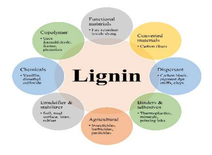
Figure 6: Different applications of Ln [24.]

Ln is an abundant, eco-friendly, low cost, less toxic and renewable polymeric material. For several years, Ln from Bm has been used for heating, soil, water reduction, oil extraction, power generation, medicine, adhesives, flocculent, cement, glue, resin, asphalt emulsifier and Fs (Fig. 6).