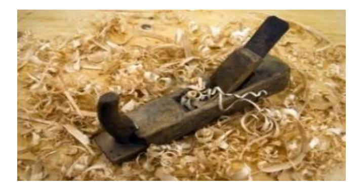
Figure 3: SD [17].

When woody material is cut to the required shape, SD is generated (Fig. 3) from various places. Regarding combustion, SD can be used in many ways. Also, as technology improves, SD can be a valuable source of power generation.